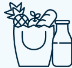
Food/Beverage Processing Plants