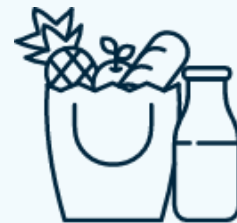
Food/Beverage Processing Plants