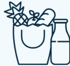
Food/Beverage Processing Plants