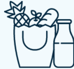
Food/Beverage Processing Plants